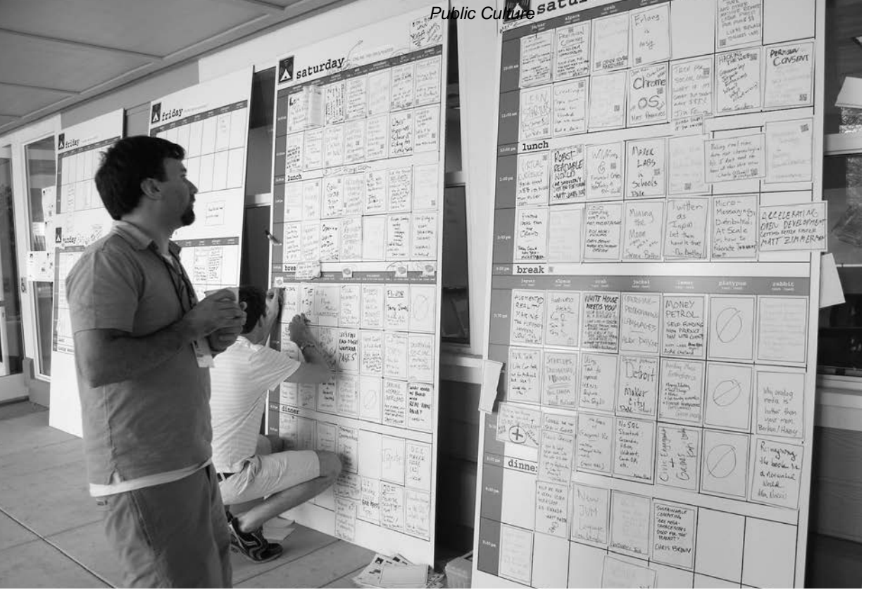
Figure 5 Proposing panel topics at Friends of O'Reilly (FOO) Camp, 2009.

import." Stogdill here underplayed the influence of FOO Camps on Silicon Valley, where a combination of strong reputation and smart ideas can launch start-ups and attract venture funding—perhaps even from O'Reilly Alpha Tech Ventures, which has seeded companies such as Bitly and Foursquare. Where Wiener and Brand developed a pattern, O'Reilly was able to both monetize and popularize it. Dozens of "unconferences" now populate the tech and business world; even the White House has embraced the unconference approach, conducting twenty gatherings around the country with minority communities to identify local and national concerns affecting Hispanics, African Americans, and other minorities. This is not to say that O'Reilly pursued this three-step pattern strictly for profit. Indeed, in his talks and essays, he often likens a company's profits to a car's gasoline—necessary, yes, but hardly the end goal ("You don't think of your trip as a series of gas stations," he has said on more than one occasion) (O'Reilly Media 2011: 83). Rather, O'Reilly's perfection of the network celebrity process represents the fusing of purpose, meaningful work, and money in a specifically Silicon Valley approach to life and business.